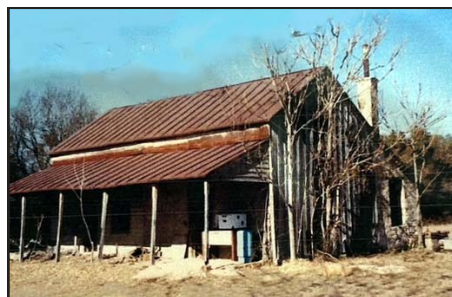
First School built in 1892

Where: Rheingold School, 334 Rheingold School Rd, Fredericksburg, TX 78624.