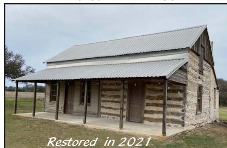
Restored in 2021

Where: Williams Creek School, 5501 South Ranch Rd. 1623