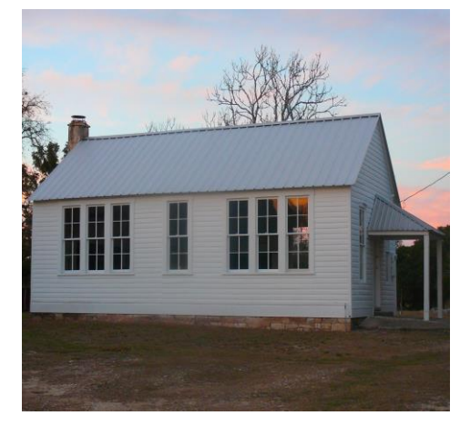
NEW PAINT INSIDE AND OUTSIDE AT RHEINGOLD SCHOOL-Looks great!

MAY 13, 2017 Cherry Mountain School-Open House & Fundrasier www.historicschools.org